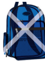
CLEAR BACKPACK (Larger than 12" x 6" x 12")