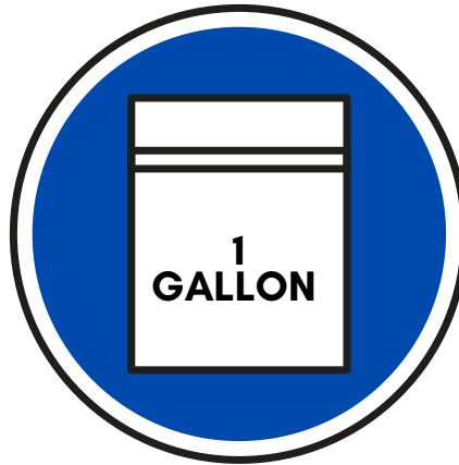
CLEAR PLASTIC FREEZER STORAGE BAG