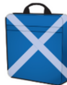
SEAT CUSHION WITH POCKET