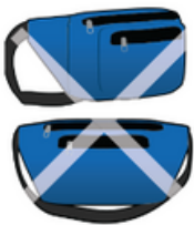
FANNY PACK (Unless clear)